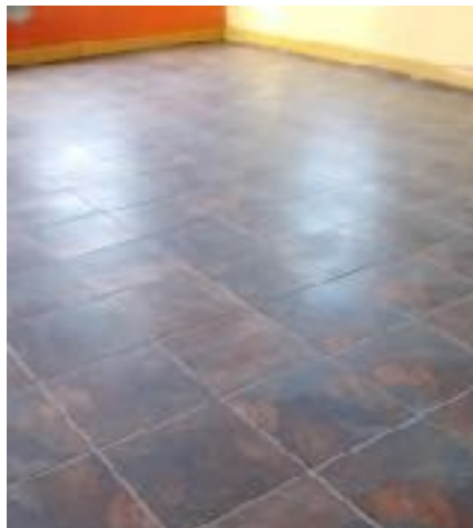
Impressive new floor

There were 3 major maintenance projects at Nomonde Pre-School: renewal of the badly worn floor of the large hall floor, the replacement of storm – damaged toddlers’ play area roof, and grounds and fencing maintenance.