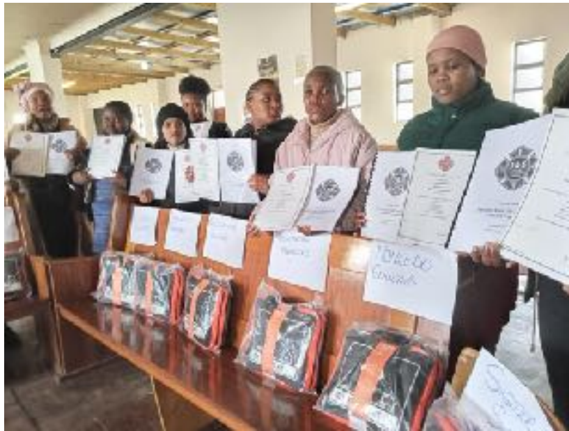
Some of the first aid trainees with certificates and first aid kits

The City of Cape Town requires pre-schools to have one member of staff able to undertake first aid and this involves three - year certification, a costly process. 40 staff attended a one - day training course, and each pre-school represented received a certificate and a first aid bag