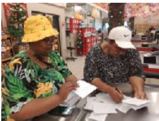
Allocating the vouchers