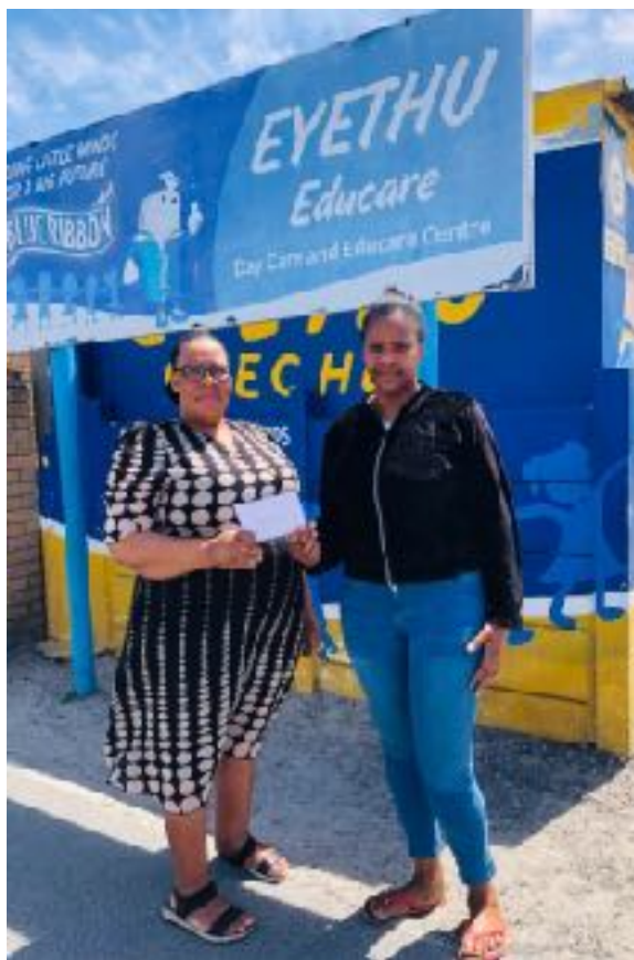
Eyethu Pre-School receiving its voucher