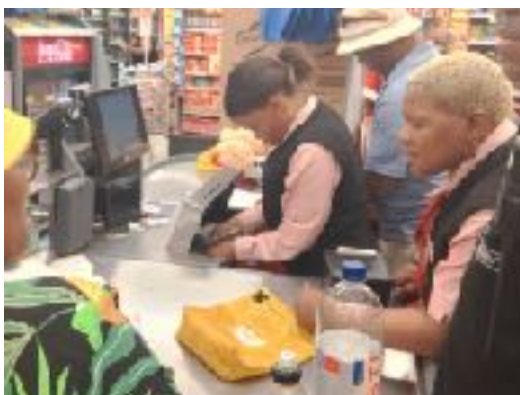
Buying the vouchers

For the fifth successive year, toward Christmas, we have provided vouchers to support end of term activities in all the Forum pre-schools, covering 3000 children. These are distributed on a pro rata basis.