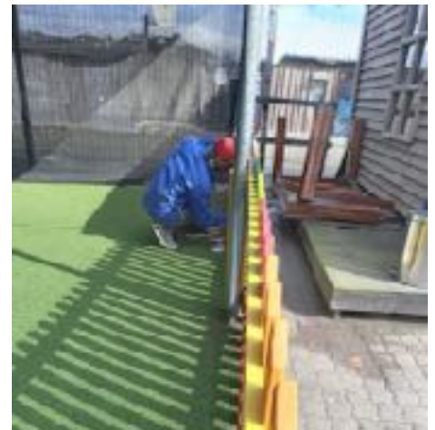
At work on maintenance