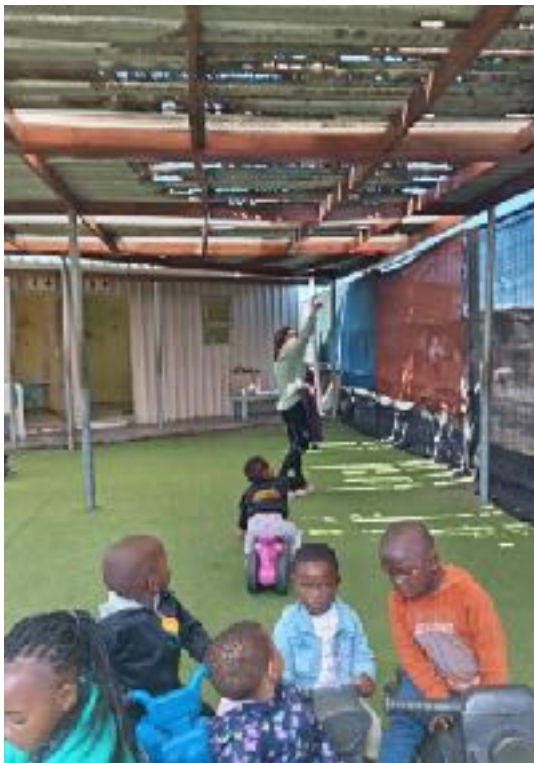
Badly storm damaged roof