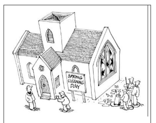
... er ... the good news is the youthgroup has made a great start by pressure-washing the west window ...