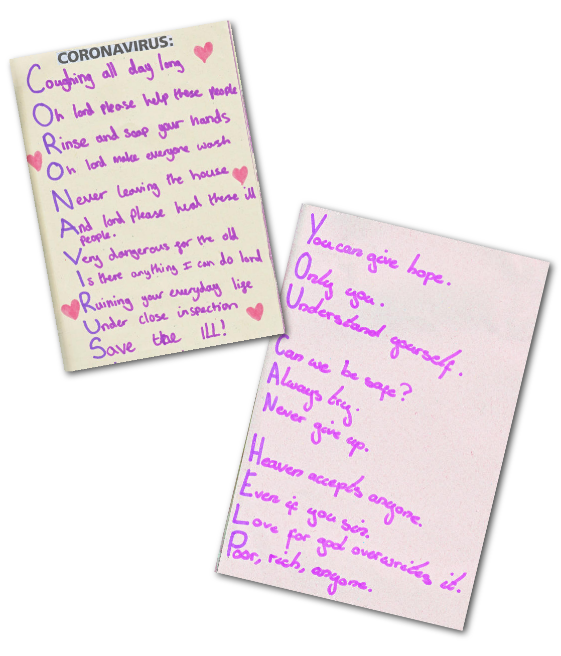
Prayers composed by children from 'Acorns' at St Mary's