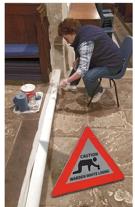
All in a day's work...